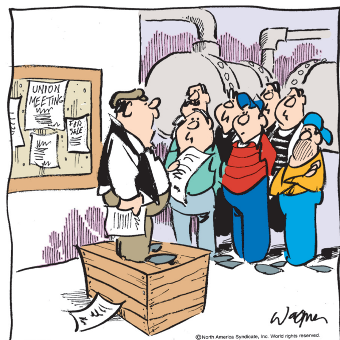
“Striking is no picnic ... you have to stand on your feet and carry a sign!”