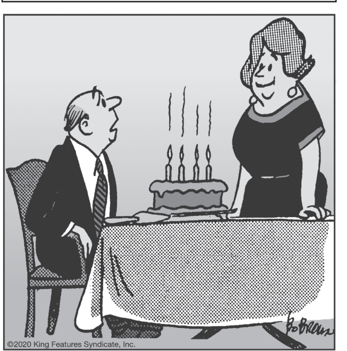
"When are you going to start having birthdays again, Irma? I'm tired of growing old alone."