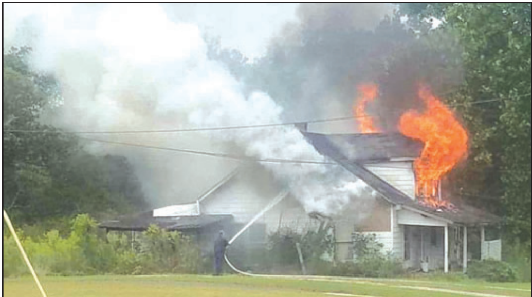
A firefighter shoots water through an upstairs window during a house fire on Kirkland Ave on Friday, Sept. 11.

VOLUME 39, NUMBER 11 WEDNESDAY, SEPTEMBER 16, 2020 IRVINE & RAVENNA, KENTUCKY 40336 16 PAGES