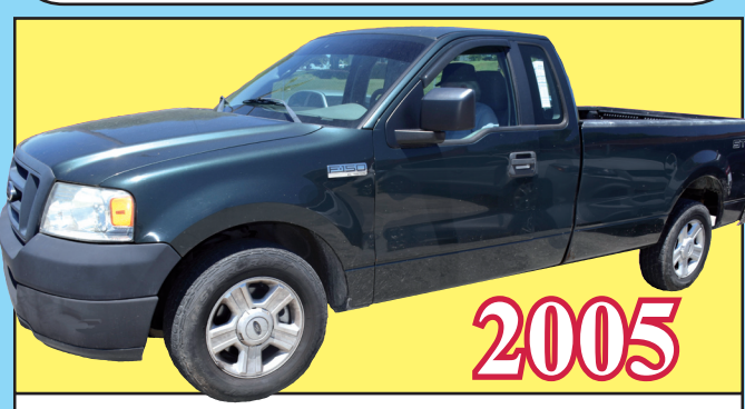
2005 FORD F-150 X-CAB

LOADED! LOCAL TRADE! EXTENDED CAB! NICE TRUCK! WE HAVE FINANCING!