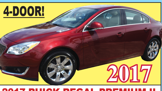
LEATHER! SUN ROOF! NAVIGATION! ONLY 25K MILES! FACTORY WARRANTY! WE HAVE FINANCING!