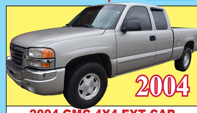
2004 GMC 4X4 EXT CAB

LOADED! LOCAL TRADE! EXTENDED CAB! NICE TRUCK! WE HAVE FINANCING!