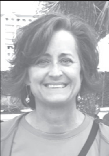
by Dawn Reed Eastern Ky. Columnist