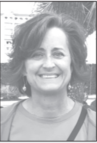
by Dawn Reed Eastern Ky. Columnist

I've never wanted to go to jail so much in my life! Legally, of course. Stupid COVID shut down all Bible studies there like a steel trap.