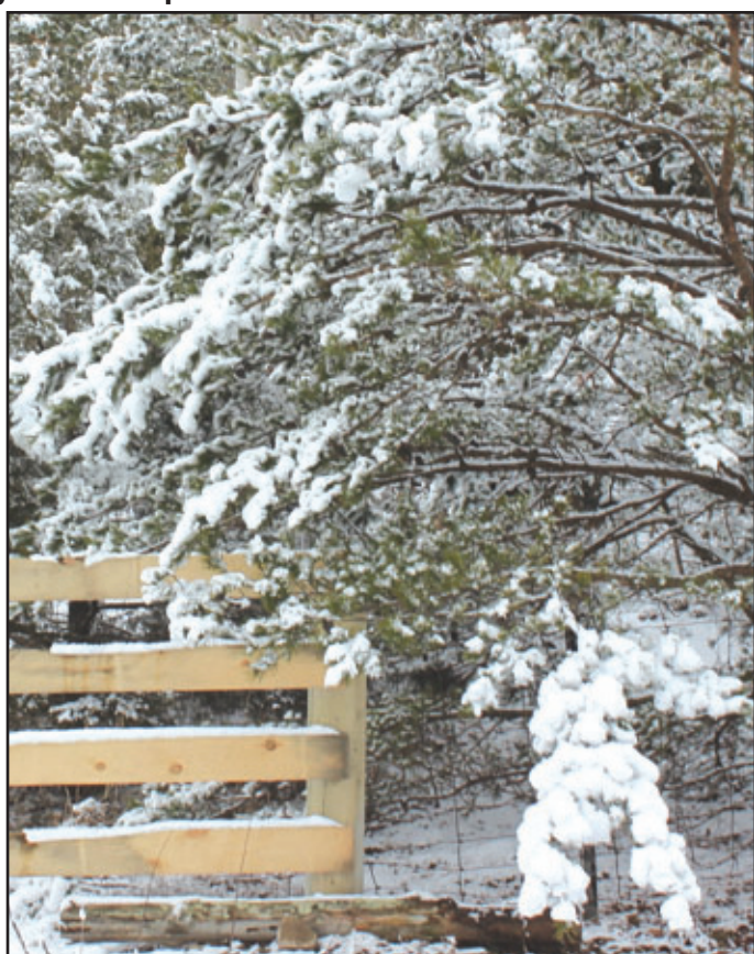
Thursday's snow weighted down branches of pine trees as seen above. More snow is forecast for this weekend, along with colder weather.