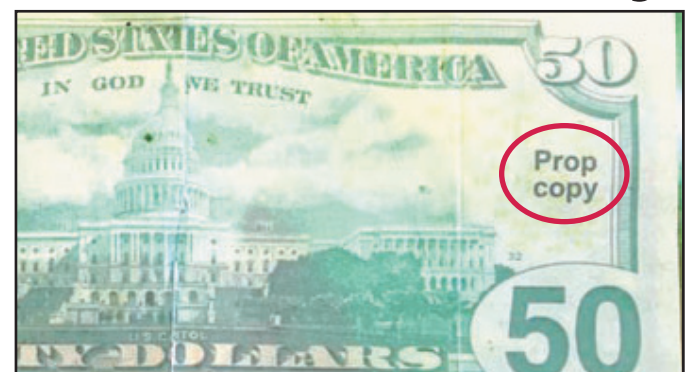
On the back side of the bills, it says "Prop Copy" about midway on the right side of the bill. Please call 723-2201 to report if you have received a bill.