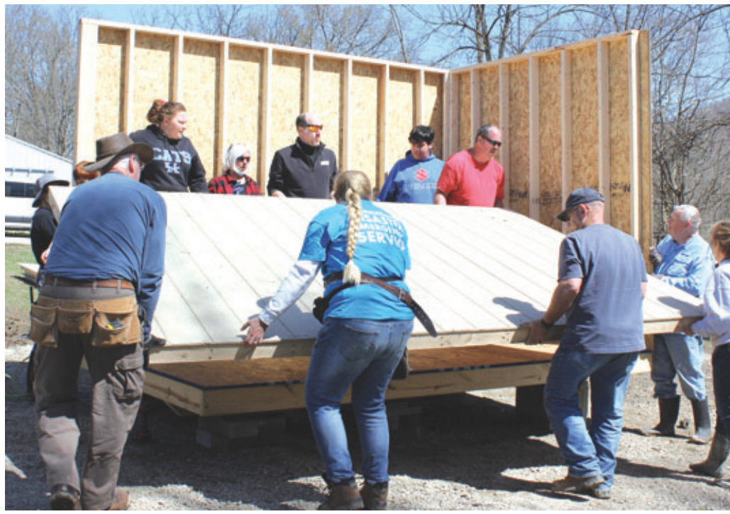
Volunteers raised the walls on a pre-fab storage building on Third Street in Ravenna on Saturday. Two teams were working side by side at two adjacent residences.