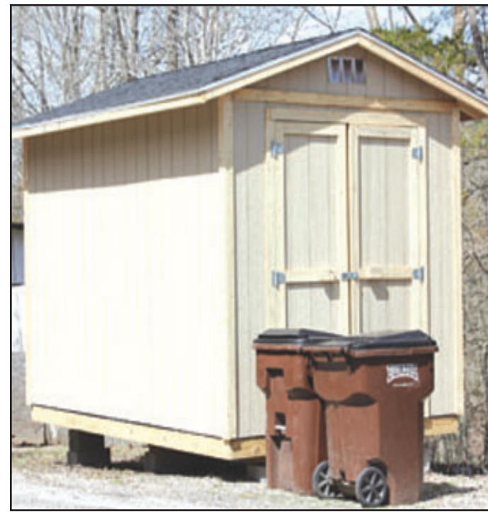
A completed storage 8x12 foot building on Wall Street is pictured above. The teams working on the buildings completed them in one day.