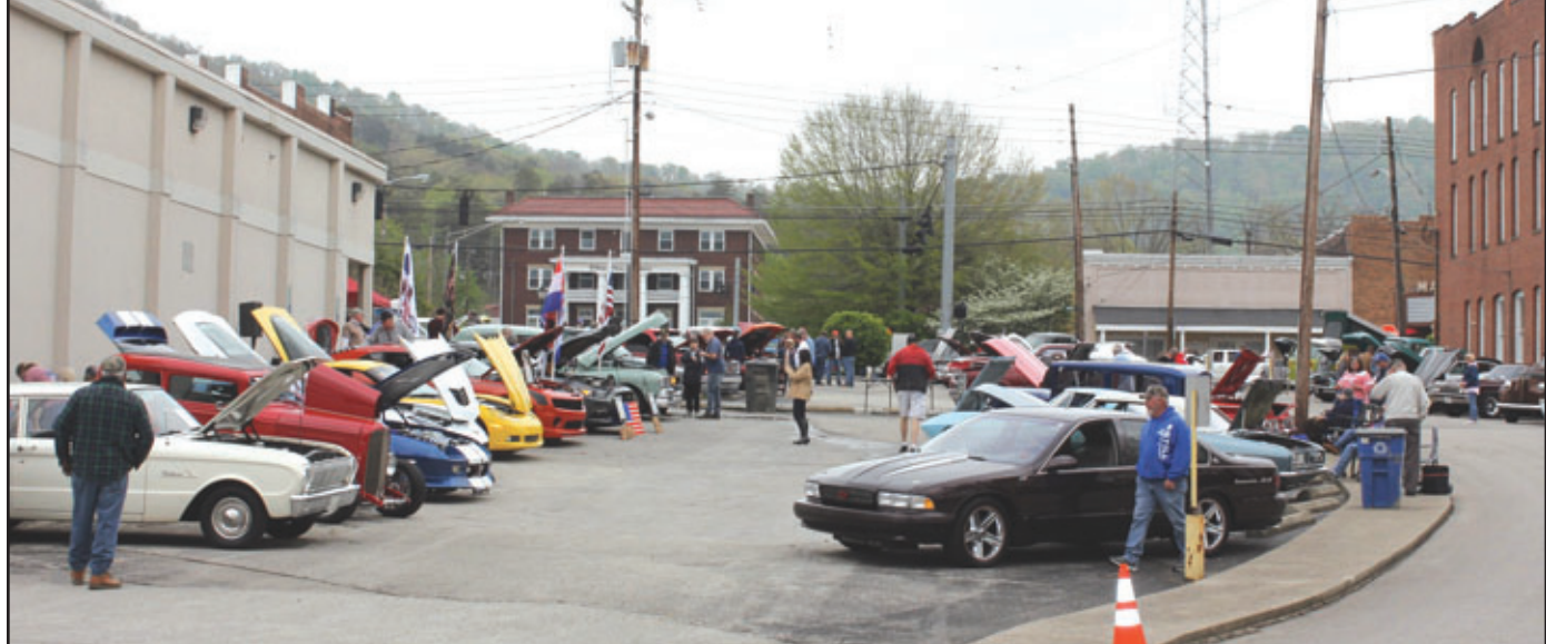
The Twin City Kruzers had a wonderful turnout for their annual car show Sunday. The show is usually held during the Mountain Mushroom Festival, which was cancelled again this year. The car show was not held last year because of the pandemic.