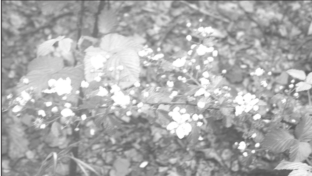
Blackberries are now blooming, which means the blackberry winter is coming soon. Frosts, freezes, and even snowflakes can be seen during blackberry winters.