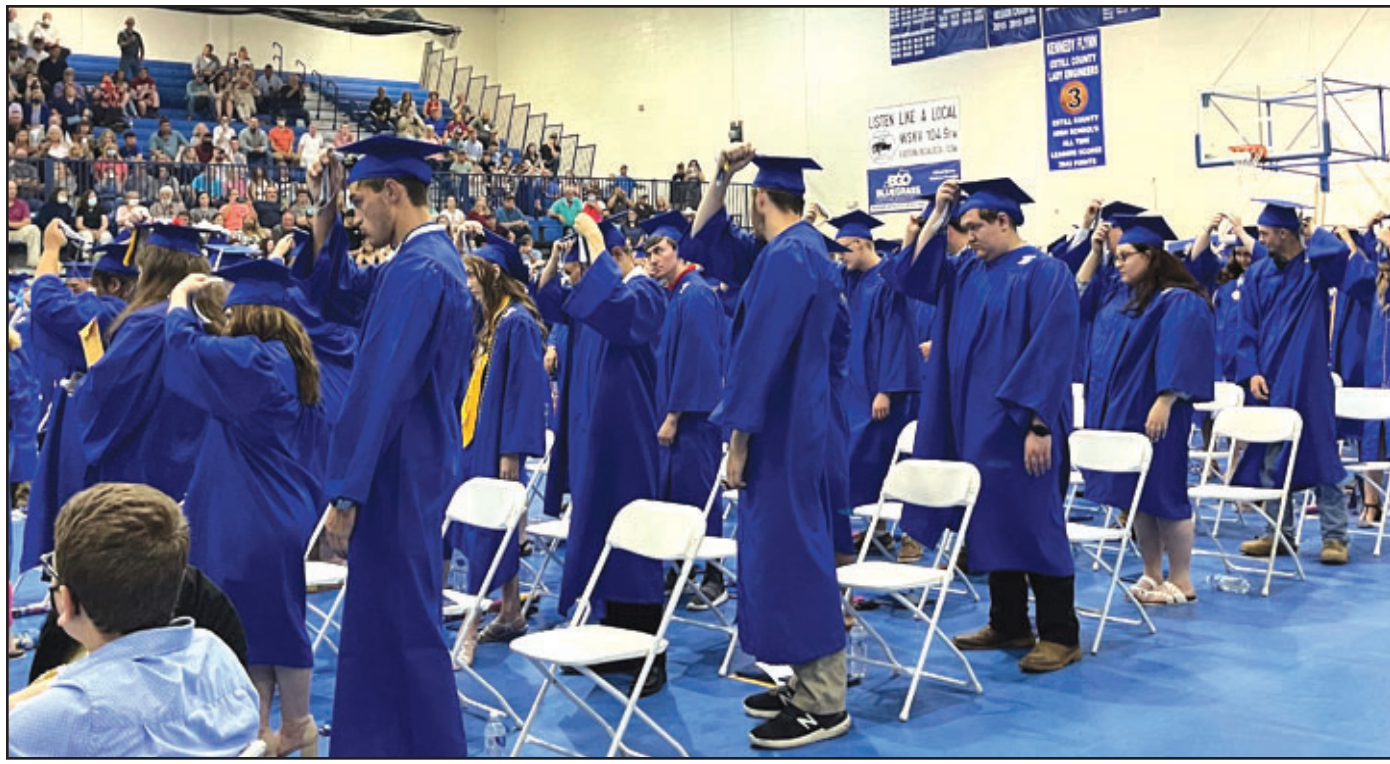
The Class of 2021 removed their tassels on their graduation caps to represent that their time as a student at ECHS had come to a close.