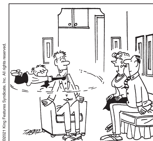
"It's a bid for attention. Just _____ him."