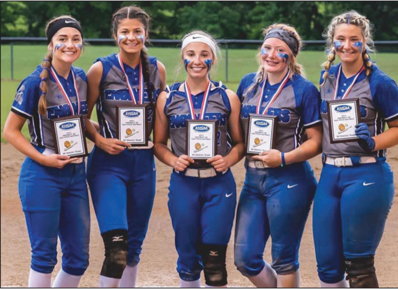
56th District All-Tournament Team