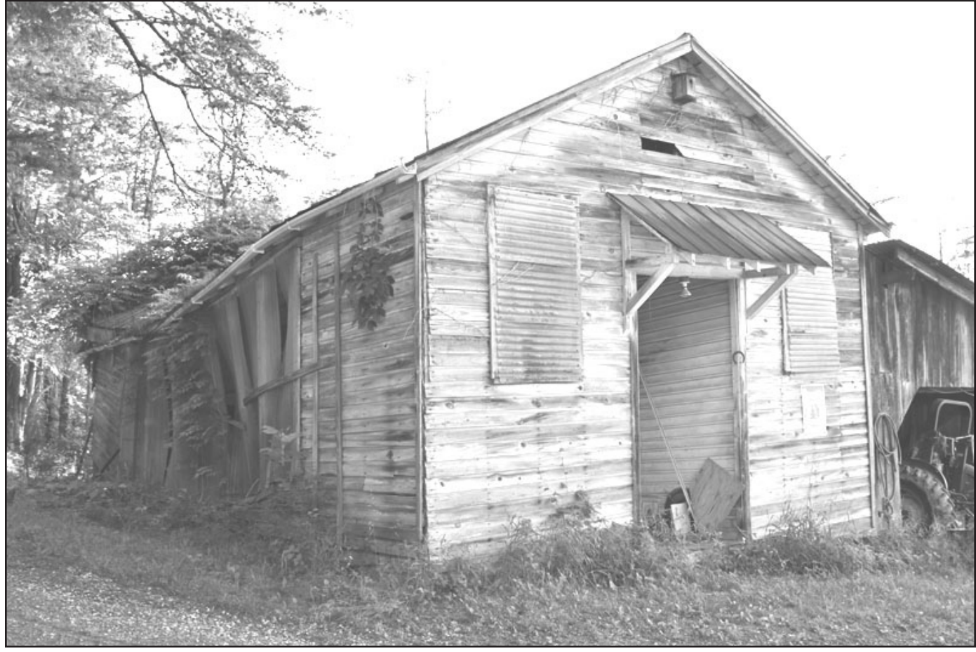
Twin Creek School, one of county's last one-room schools