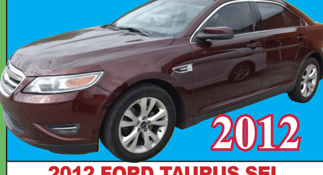
2012 FORD TAURUS SEL 4-DOOR! LEATHER! NICE FAMILY CAR! LOCAL TRADE!