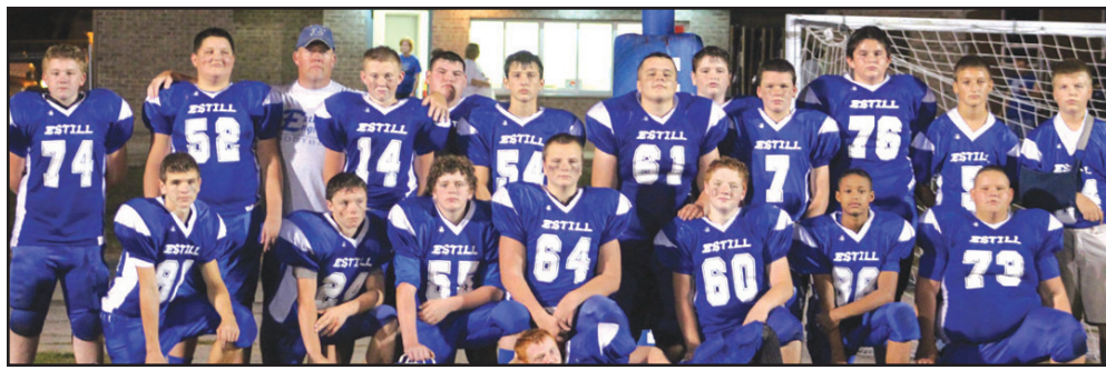
Patriots Make Playoffs For 2nd Year – Page 14, 15

Jay Bicknell's Wanderings From The Woods & Water Page 12