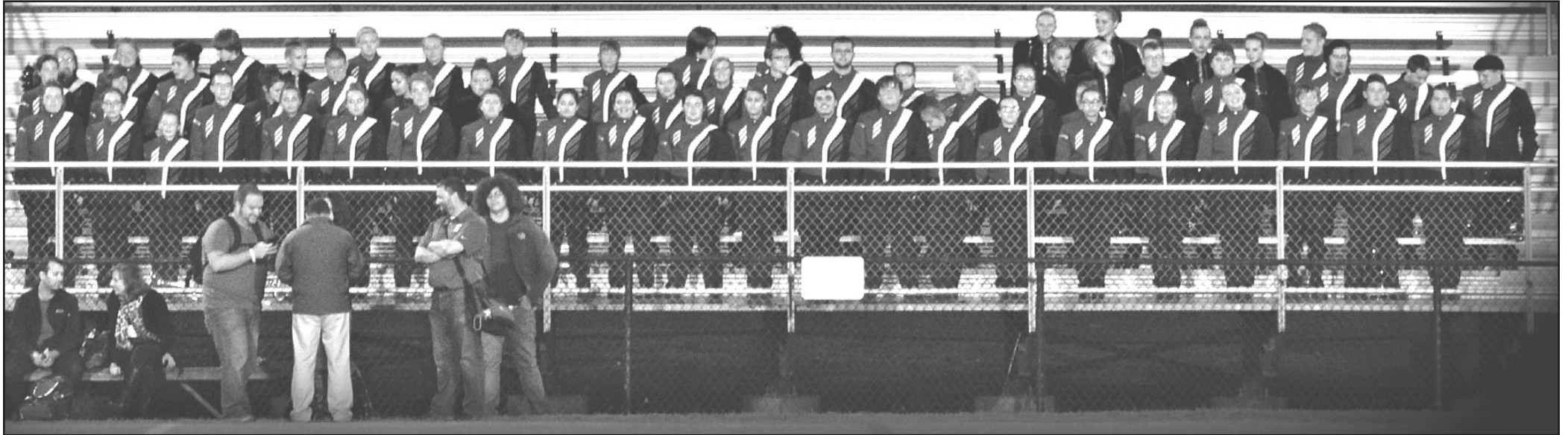
East Regional Champions -- The Estill County Marching Engineers

Good luck, Estill County Engineers Marching Band!