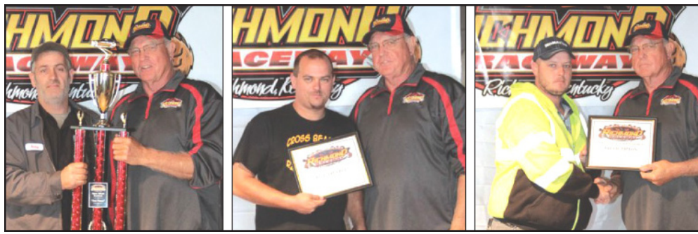
Richmond Raceway Winners - Page 17

Tammy Terry's Front Porch Ponderings Page 3