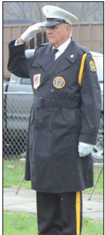
A member of the American Legion Honor Guard saluted the American flag during Saturday's ceremony for Veterans Day.