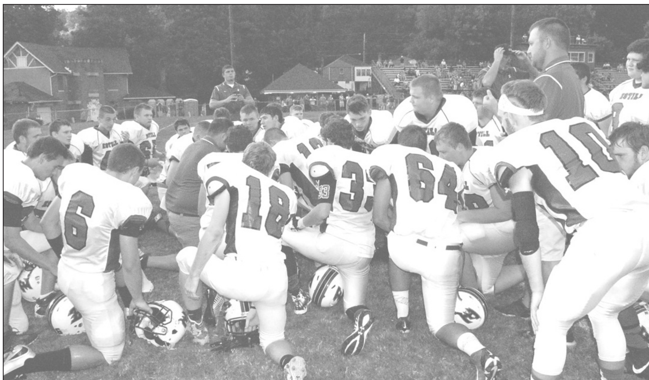
The Estill County Football Engineers started the game off with a prayer earlier in the season at Frankfort