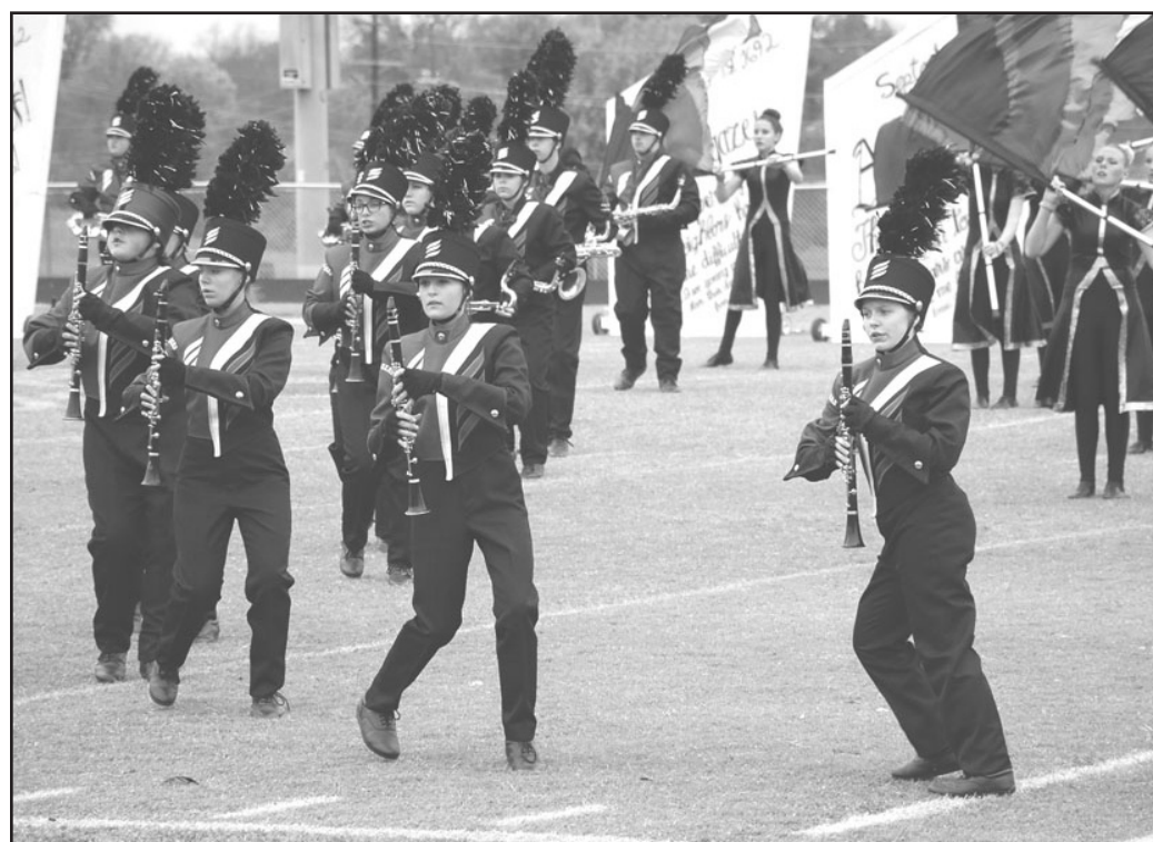
Semi-finals at Glasgow, Kentucky