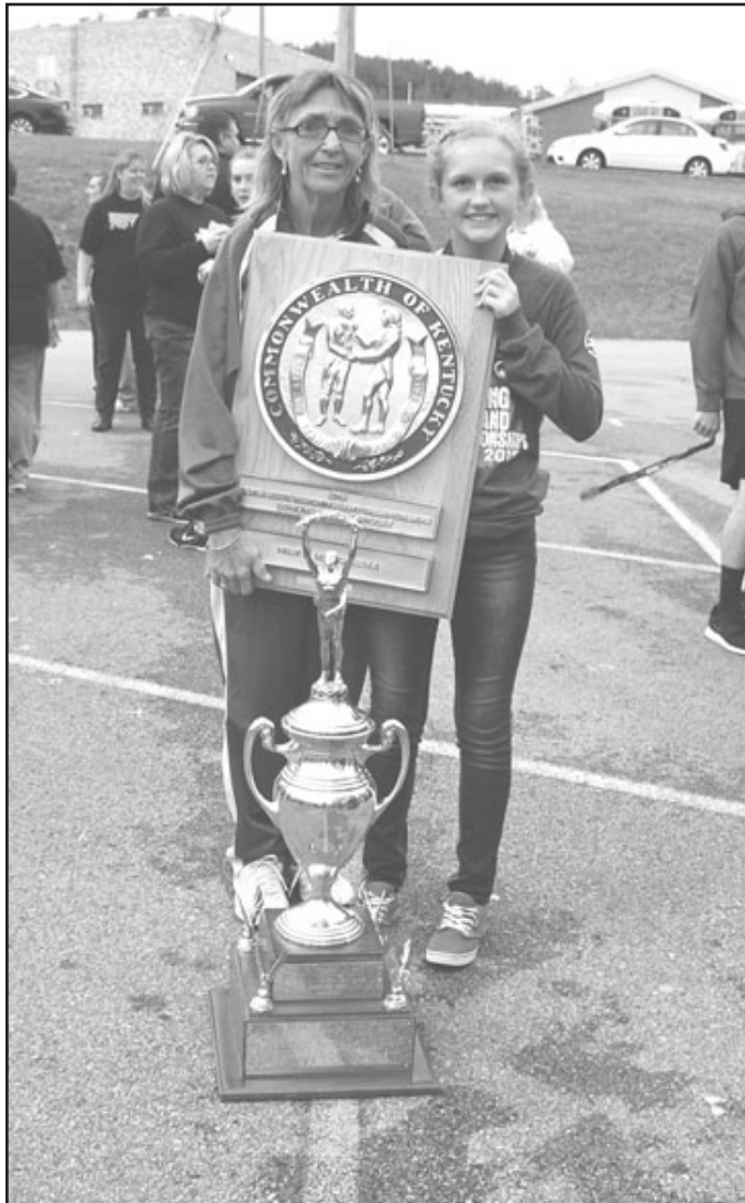
Photo time with parents and grandparents