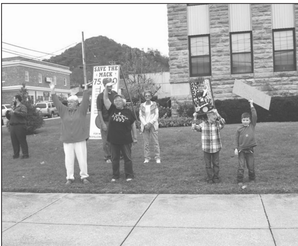
Estill band supporters cheer them on at the Courthouse!