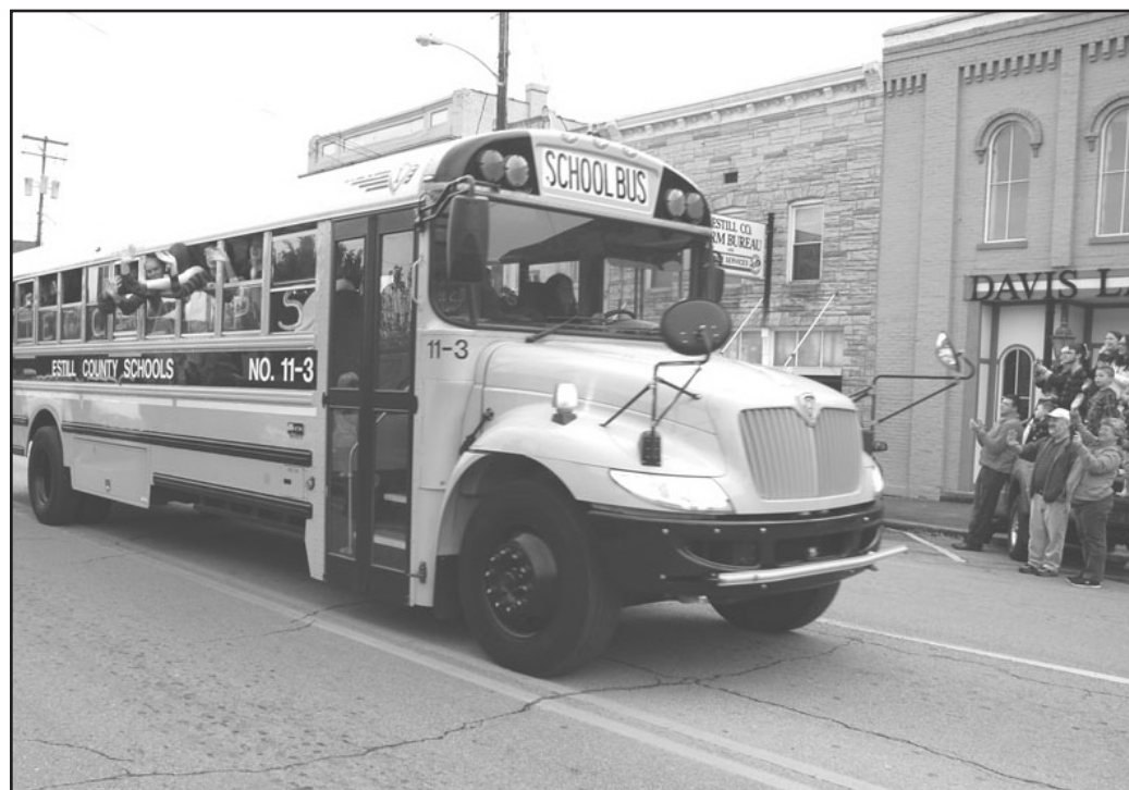
A big reception for the band on Main Street

All Estill Tribune photos available for download at < www.EstillTribune.Com >