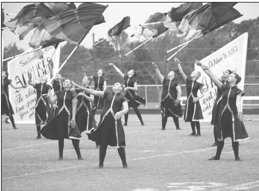
The Color Guard at Glasgow in semi-finals!