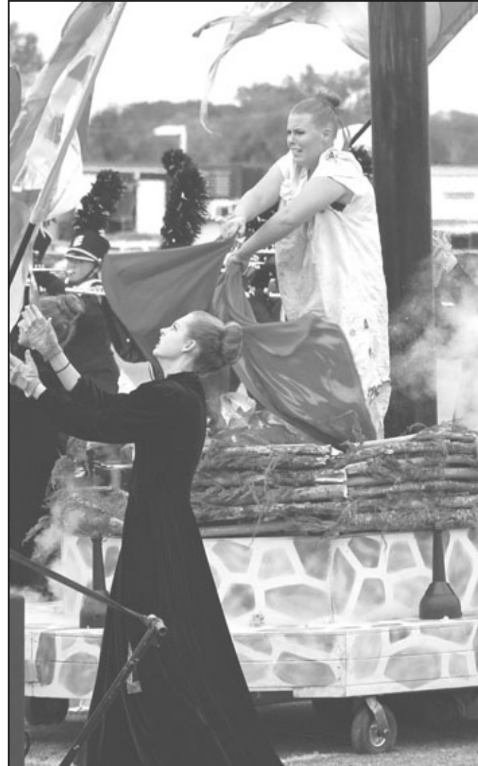
The Salem Witch and Color Guard