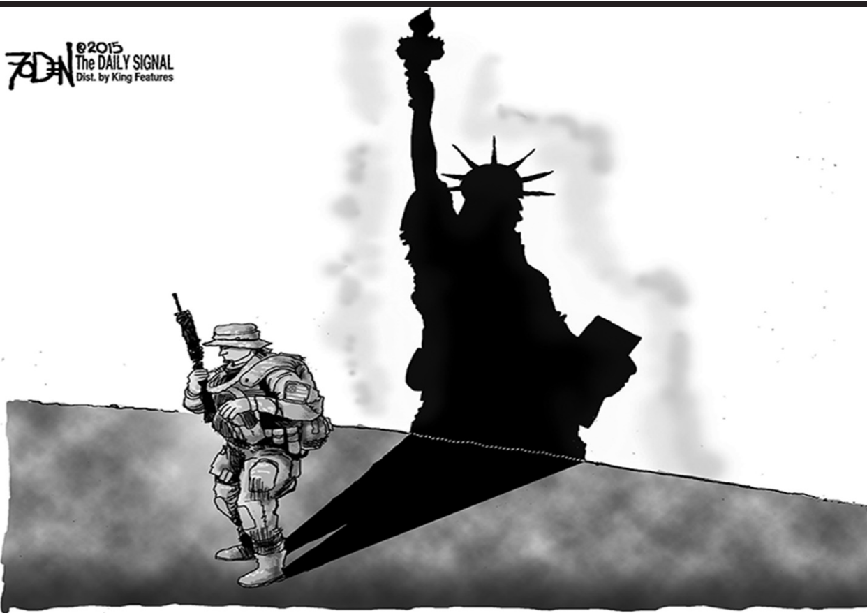
IT TAKES ONE... to ENJOY the OTHER

70th Anniversary 2015 The DAILY SIGNAL Dist. by King Features