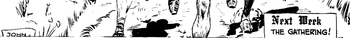
SAVE THIS FOR YOUR SUNDAY SCHOOL SCRAPBOOK