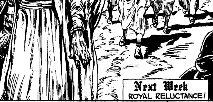
SAVE THIS FOR YOUR SUNDAY SCHOOL SCRAPBOOK