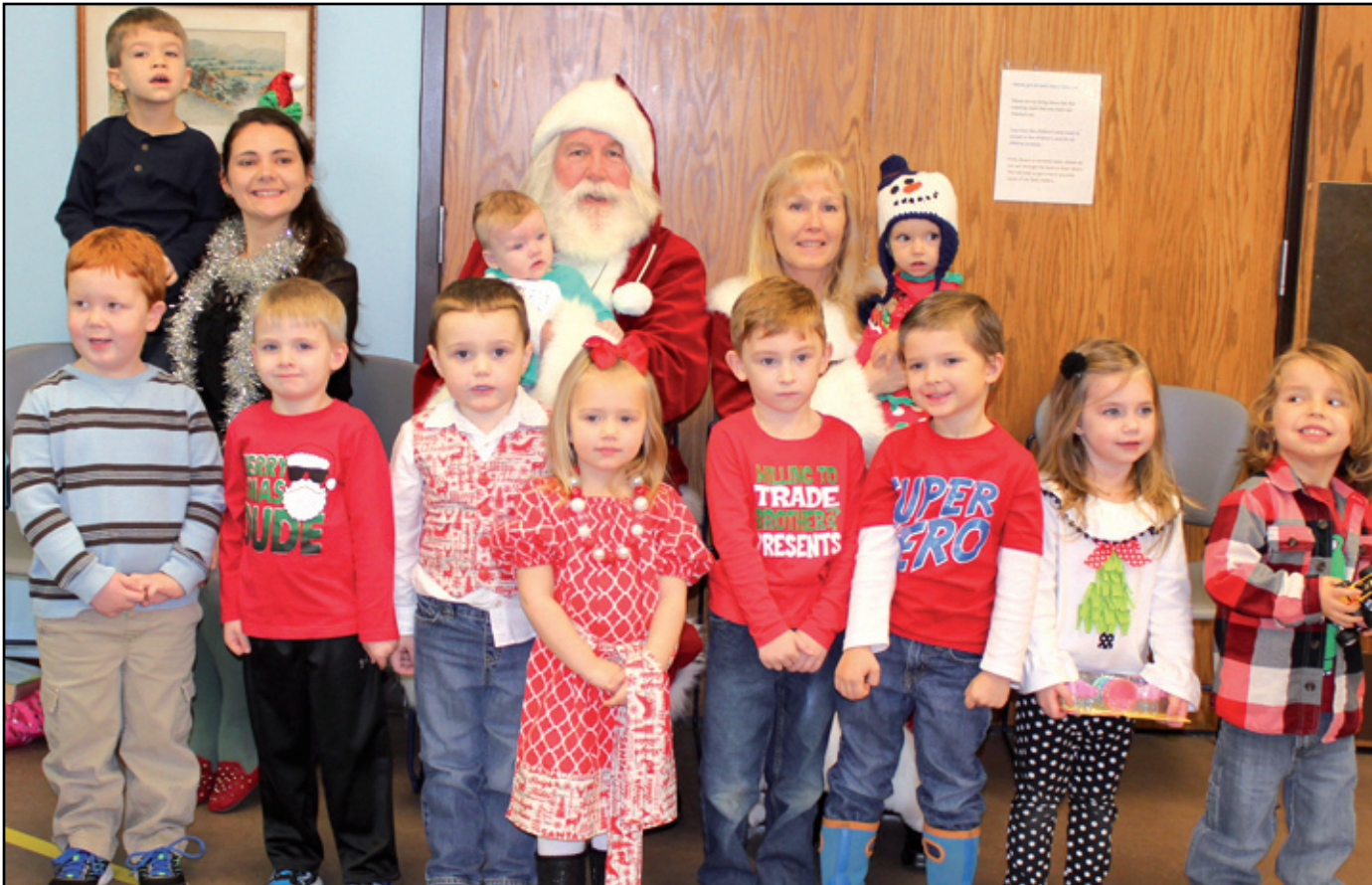
Santa Claus and Mrs. Claus made an early appearance Friday's Story Time at the Estill County Public Library. They posed for a photo with all the good boys and girls, and read stories to them.

VOLUME 34, NUMBER 25 WEDNESDAY, DECEMBER 23, 2015 IRVINE & RAVENNA, KENTUCKY 40336 20 PAGES