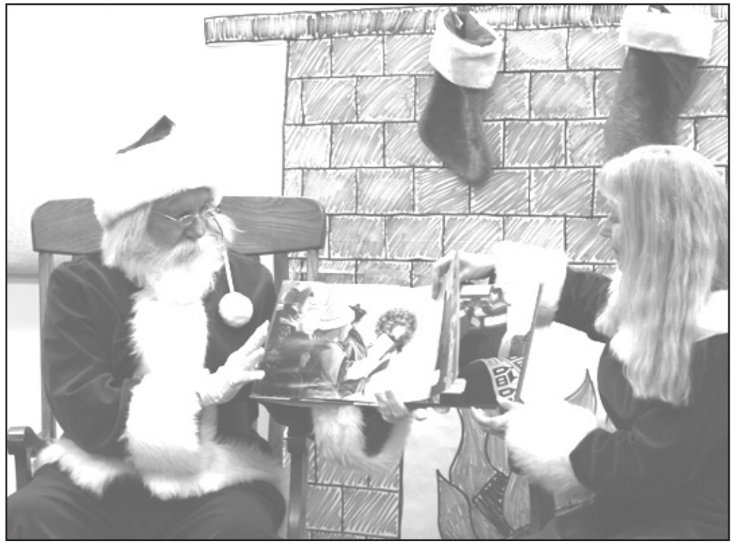
Santa and Mrs. Claus read books about Christmas to the children attending Storytime at the library on Friday. They hold up the book so the children can see the pictures.

He added the community came together during this time to support each other.