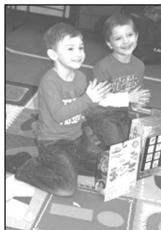
Presents from Santa!