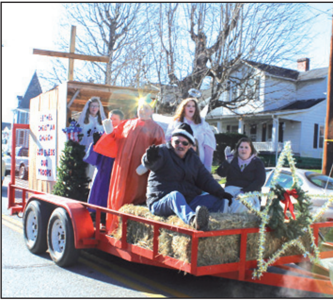
The youth from Bethel Christian Church had a nativity scene on their float during Saturday's parade.