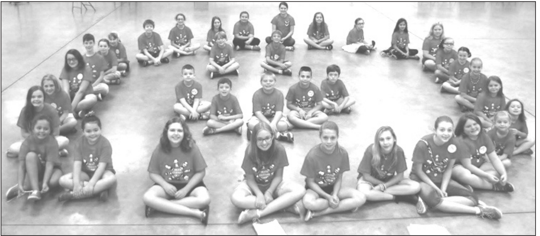
River City Players hosted their annual camp for youngsters last week. This year's camp was well attended and it was called "Telling Estill County's Story." The camp concluded with the group performing a short play "Nothing To Do In This Town," written by Donna Crowe. The play will be expanded and River City Players will perform the larger version of it on September 4.