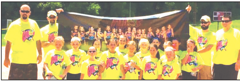
Estill 8U is Fifth At Gatlinburg – Page 15