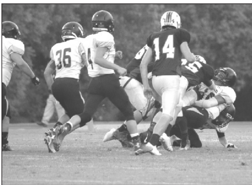
The Engineers fell short to Fleming County by two points during their first home game of the season on Friday night. The final score of the game was Fleming 38 and Engineers 36.