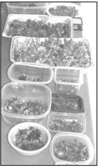
Beulah Moore saves seed for next years. The containers of drying seed are lined up on her porch at Wallace Circle.