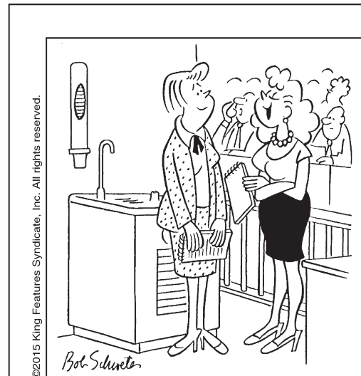
"Wearing tight jeans got me plenty of dates, but getting a job was what got me a _____!"

PS-075 Aug. 26, 2015 Visit us at SowerMinistries.Org