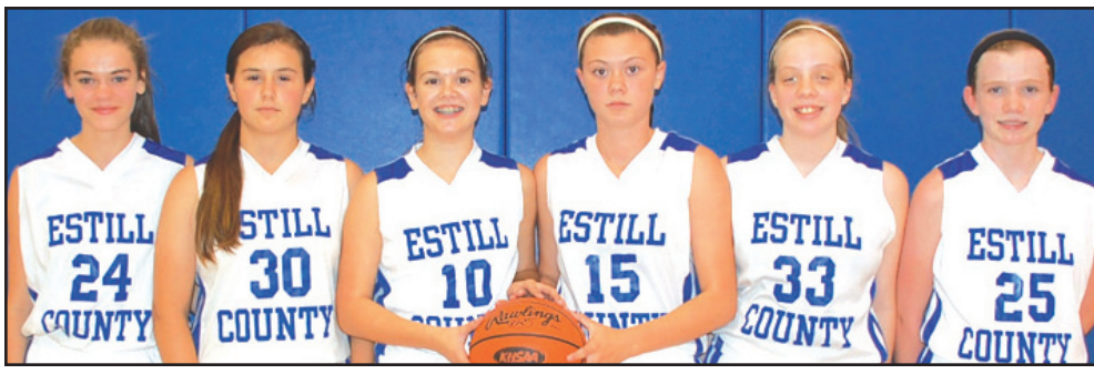
Lady Patriots Pick Up Three Wins – Pages 14 & 15

Tammy Terry's Front Porch Ponderings Page 3