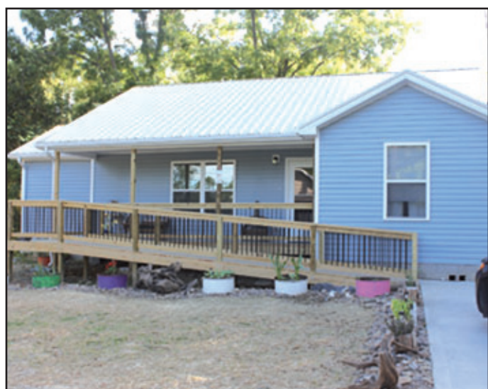
Debbie Fields' new home has blue vinyl siding and is completely handicapped accessible. The family has plants around the ramps, while the yard has been sown for grass.