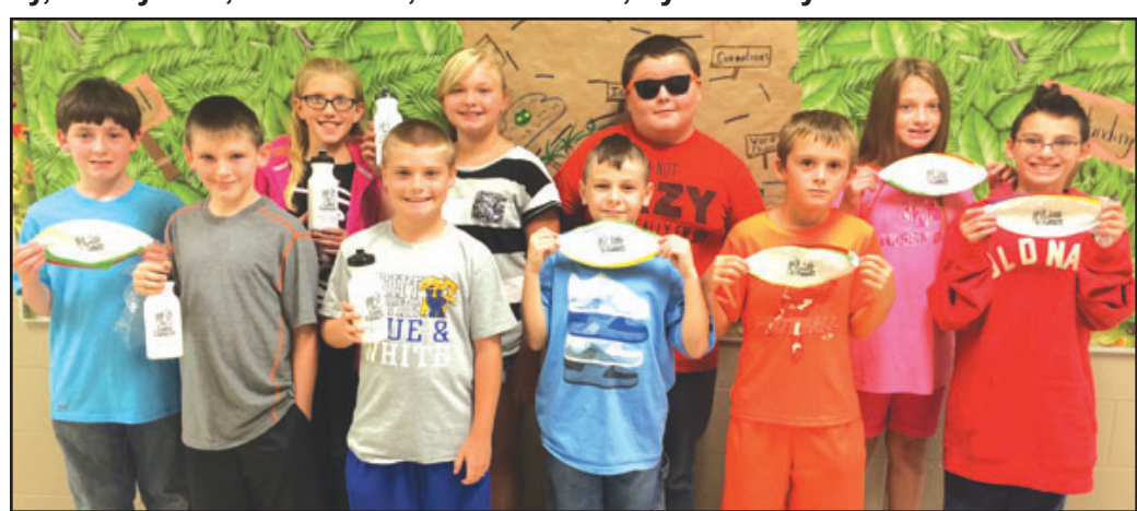
"Students at West Irvine Intermediate were excited to receive their prizes, donated by Little Caesars in Irvine, for completing a level in Lexia! Students will continue to receive a Little Caesars prize throughout the school year as they complete a level in Lexia. A special thank you to Little Caesars for donating prizes to encourage student achievement!"