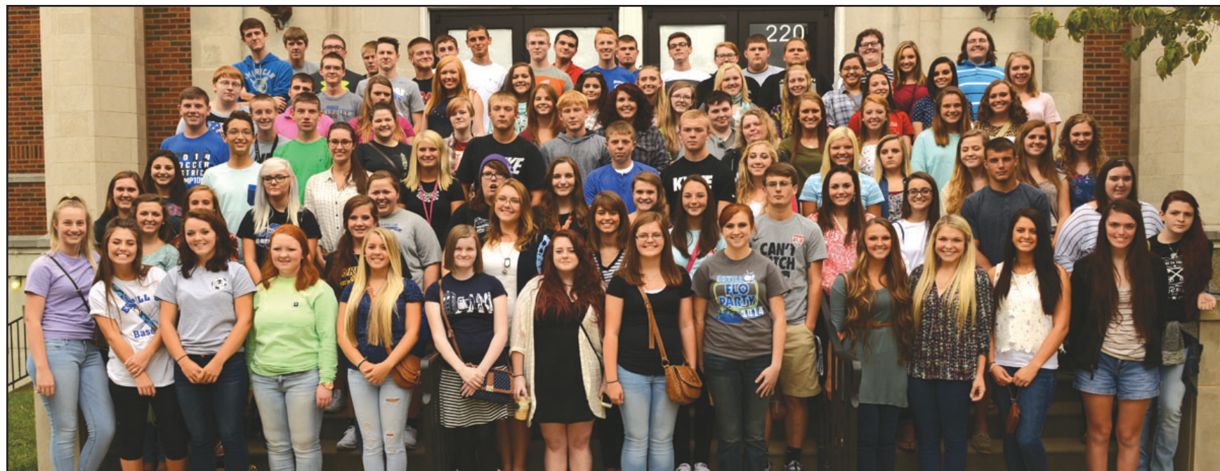
ABOVE: Students from Estill County High School visited the Morehead State University campus as part of the Early College Program, Wednesday, Aug. 26, 2015. More than 50 high and technical schools offered MSU classes during the fall semester with more than 2,000 high school students participating in the program. MSU and the partner schools are collaborating to meet a goal of 24 college credits for all high school students before they graduate. A minimum 3.0 grade point average and an 18 composite ACT score are necessary.