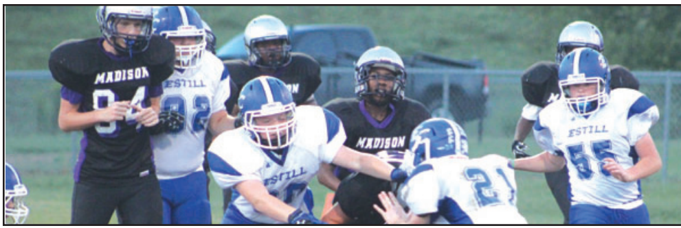
Patriots Win 44-14 Over Madison Middle – Page 15

Marching Band Wins 1st At Bourbon Pages 14-15