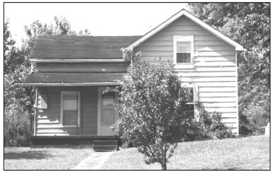
749 Cedar Grove Road, Irvine, Ky.

LOCATION: 749 Cedar Grove Road, Irvine, Ky.