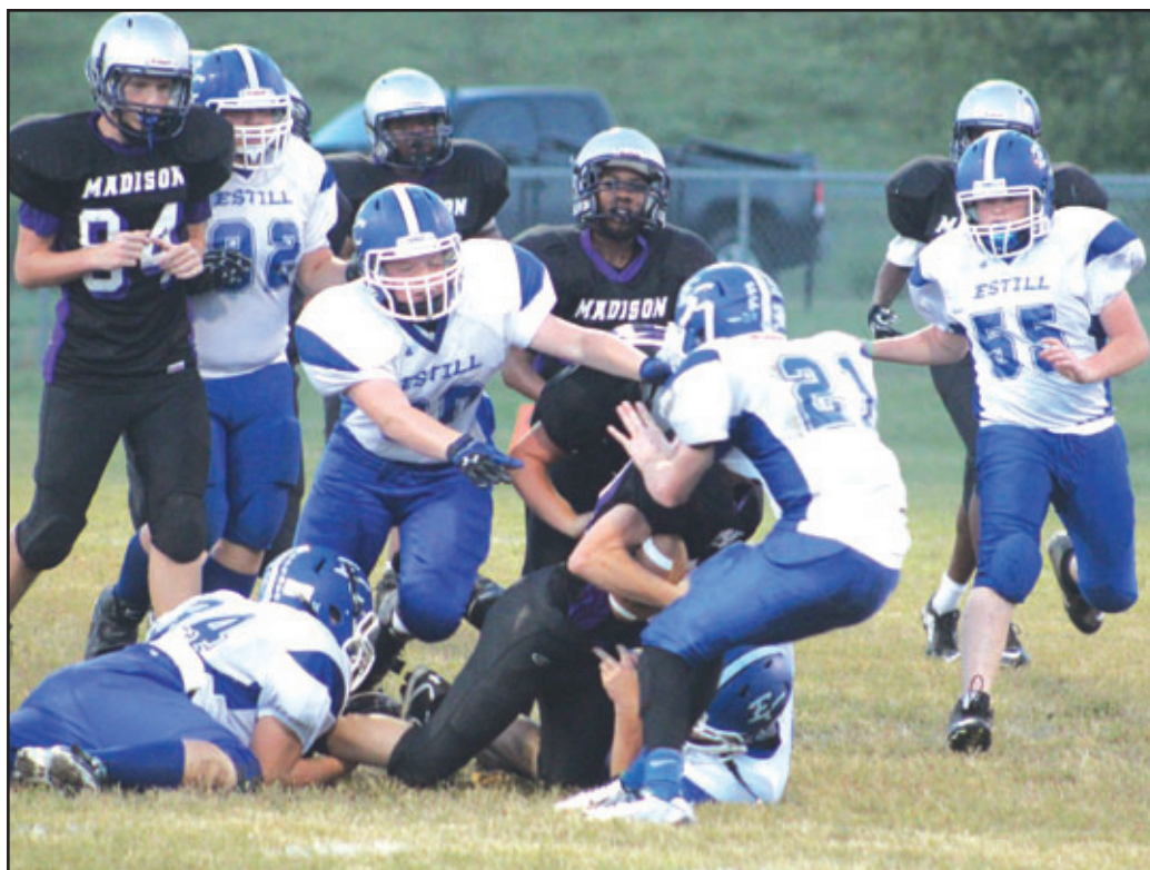
The Patriots were unstoppable and lead the entire game against Madison Middle on Thursday night. The final score of the game was 44-14.