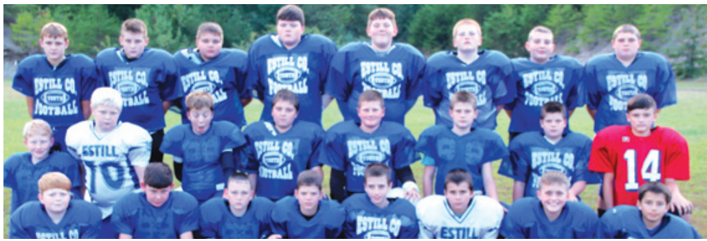
Estill Youth Football Tackle Teams -- See Page 15

Jay Bicknell's Wanderings from the Woods & Water Page 14