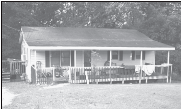
Vinyl Siding House