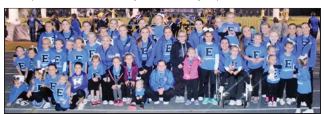
ECHS Cheerleaders had help cheering the football team on to victory during the Friday night football game. Could the future Engineers be any cuter!?!