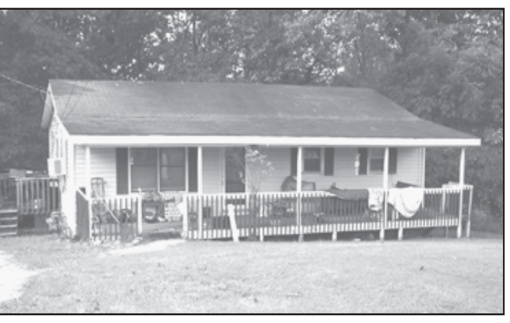
Vinyl Siding House