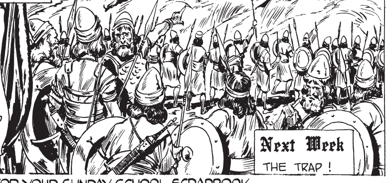
SAVE THIS FOR YOUR SUNDAY SCHOOL SCRAPBOOK

THE ARMY OF BERA, KING OF ALL SODOM, HAVING BEEN FOREWARNED, HAS GATHERED AT THE VALE OF SIDDIM WITH BERSHA, THE KING OF GOMORRAH, AND SOME OTHER LOCAL KINGS, TO GIVE BATTLE AND TO PROTECT THEIR CITIES AGAINST THE INVADERS - BUT BERA'S PLANS ARE NOT WELL FORMULATED OR HE WOULD NEVER PICK THE SIDDIM VALLEY AS A PLACE TO FIGHT THE FOE!