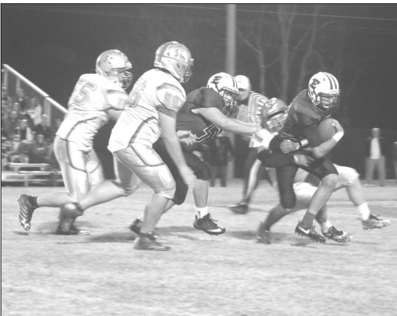
The Engineers faced off against the Casey County Rebels at home on Friday night in their second playoff game. The Engineers fought hard throughout the game but were still no match against the Rebels. The final score was 49-21.