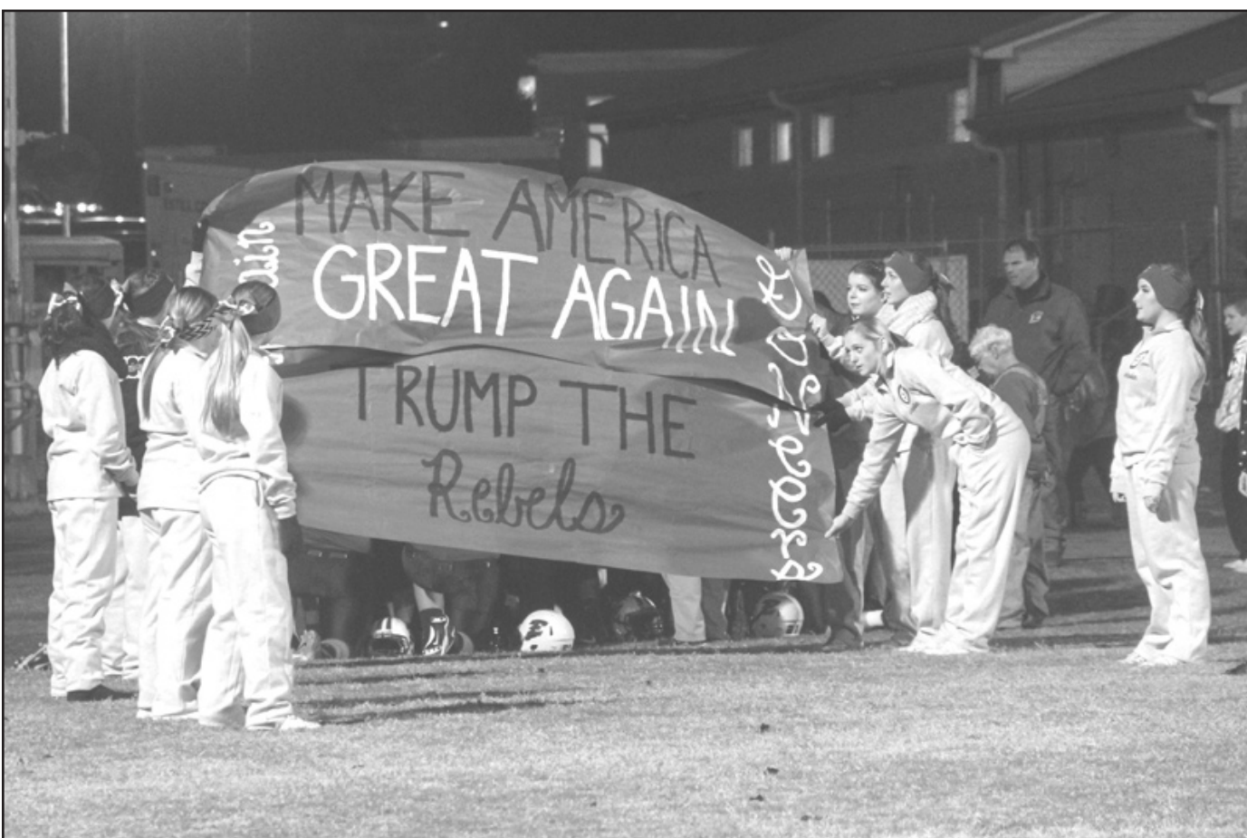
The Estill County High School cheerleaders incorporated the presidential election results into the banner that the Engineers busted through before their game against Casey County.