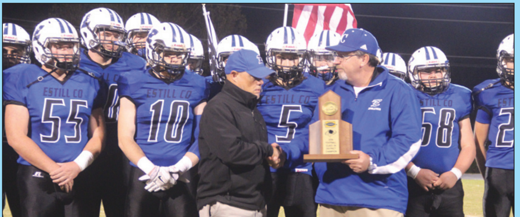
Class 3A District 7 Winners – The Estill County High School Engineers