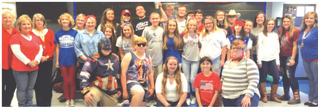
FCCLA's "Red Ribbon Week" at ECHS -- Page 7

3 Weeks Until Breakfast with Santa Page 2