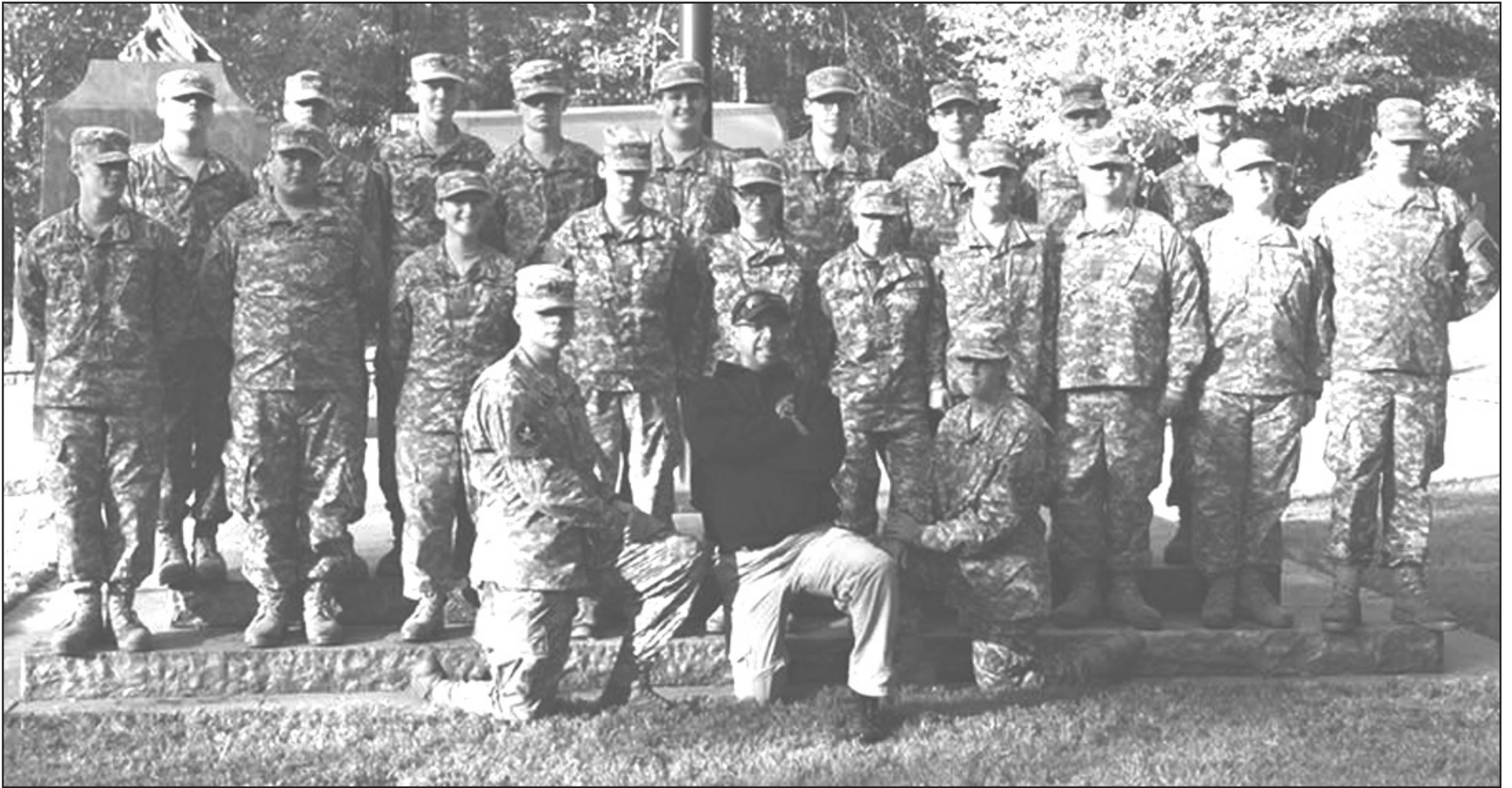
17th in Nation

Congratulations to the JROTC Raiders from Estill County High School on their finish of 17th during national competition over the weekend.