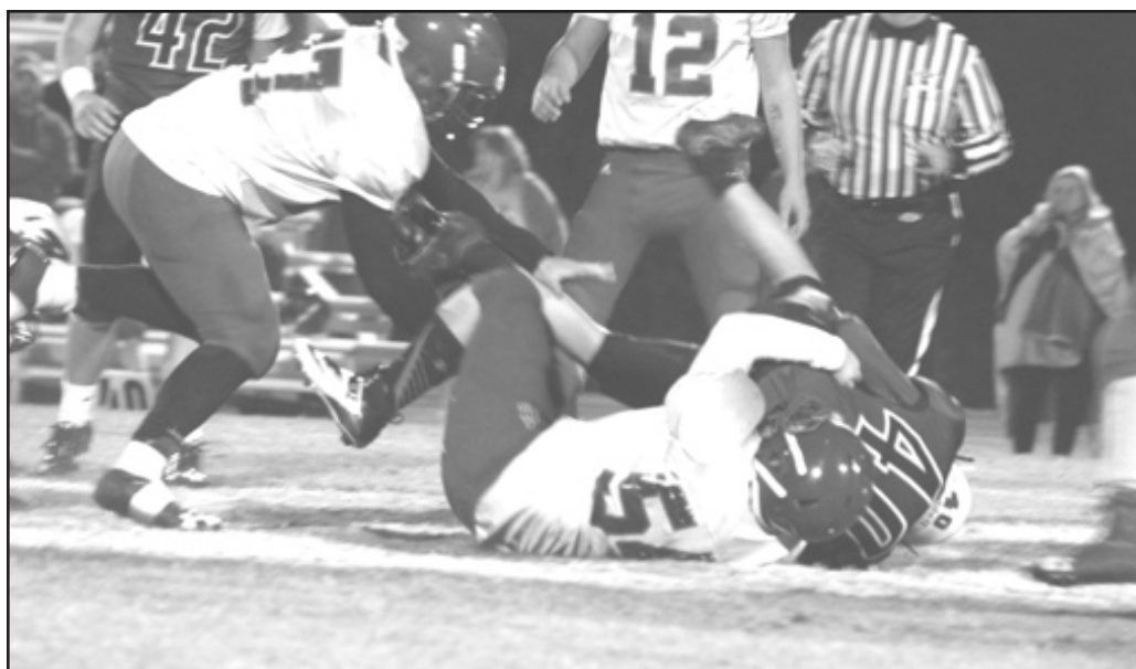
The Engineers defeated the Jackson County Generals in the first game of playoffs 48-6.