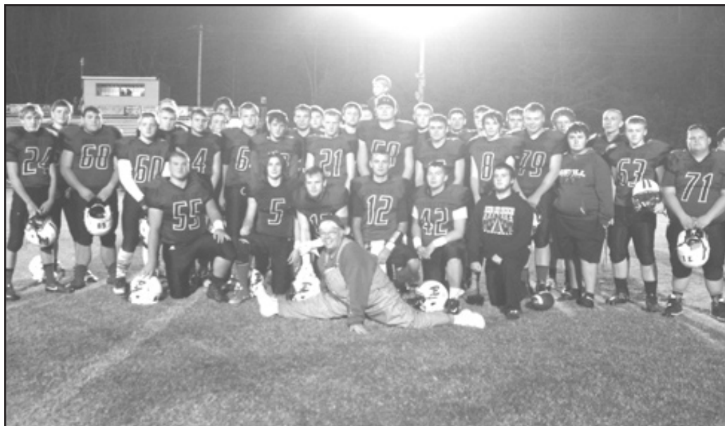
The Estill County Engineers before their big win on Friday night over Jackson County. This is the first time that the Engineers have held the title as District Champs.