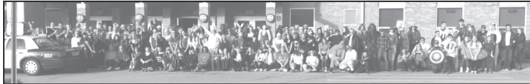
Freaky Friday (Whole School) in Halloween costumes