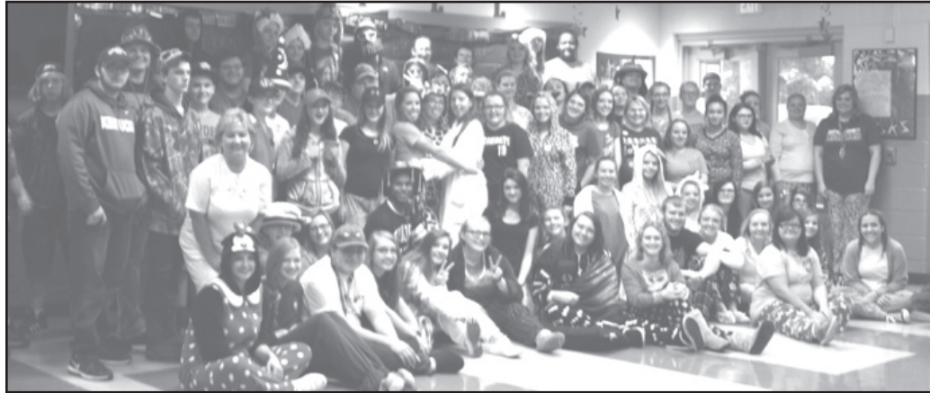
Hat & Pajama Day on Thursday