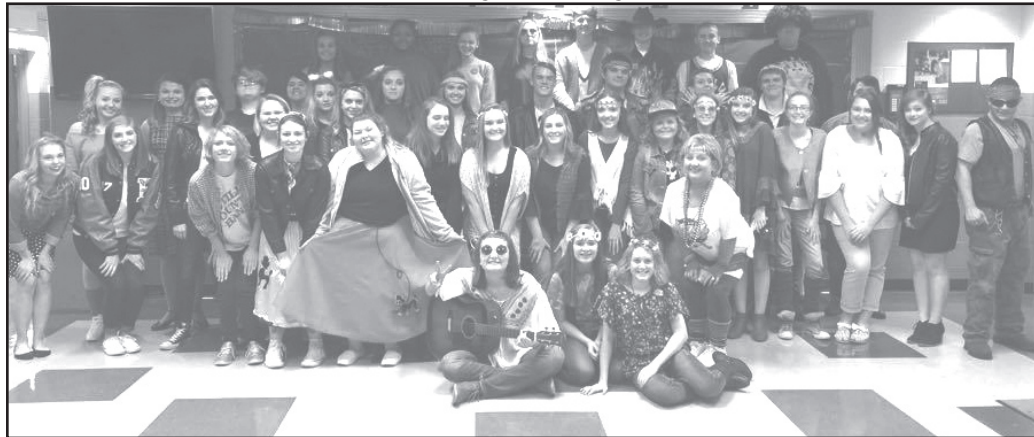
Way Back Wednesday (dress from past decades)