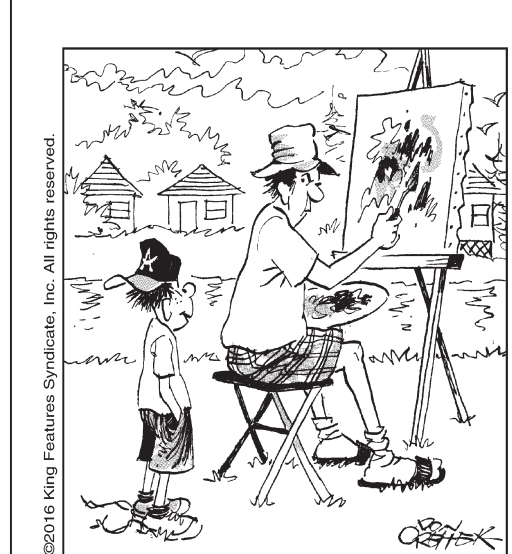
"We did that in _____ School!"