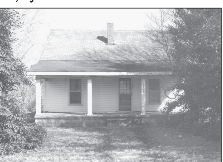
1600 Sand Hill Road, Irvine, Ky.

kitchen & bath on main level. There is a 13' breezeway connecting the house to a 14' x 25' one-car garage. The property has city water, small outbuilding and a 48' x 65' barn. The subject property has 540' of Sand Hill Road frontage. This farm has several springs, pasture land, wooded area, timber and is partially fenced.