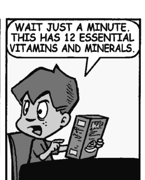
MY TASTE BUDS REVOLT AGAINST ANYTHING THAT IS GOOD FOR YOU.